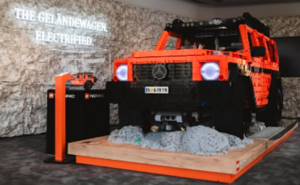
Stars at the ZFF: Mads Mikkelsen (2023) and the G-Class made of around 450,000 LEGO pieces (2024).