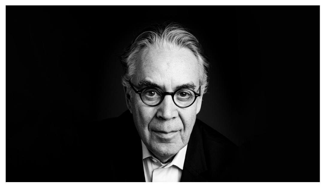
Howard Shore