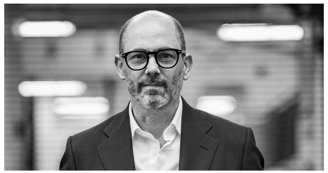
Edward Berger