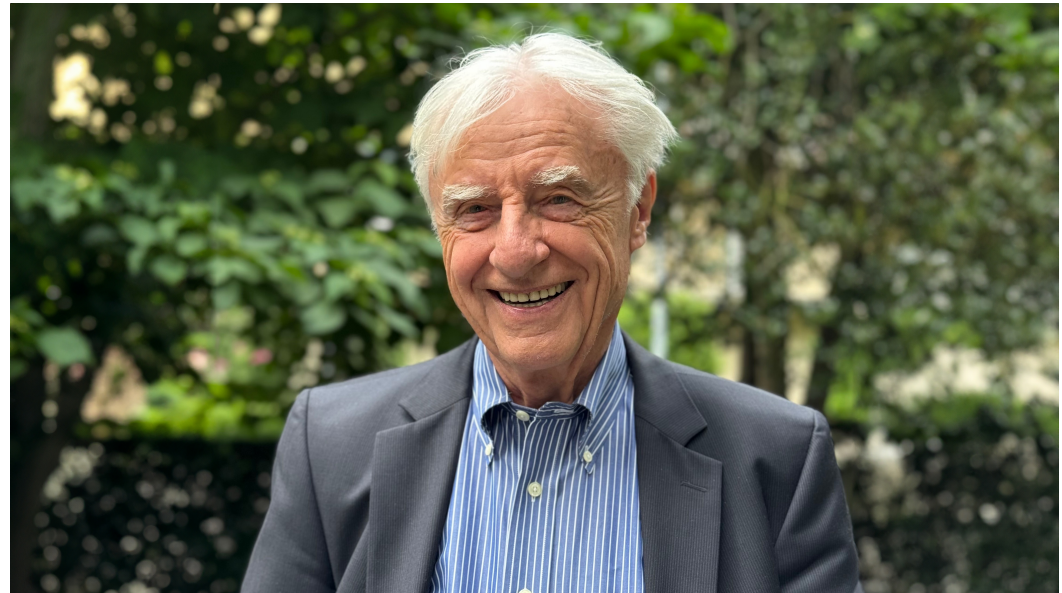
Emil Steinberger