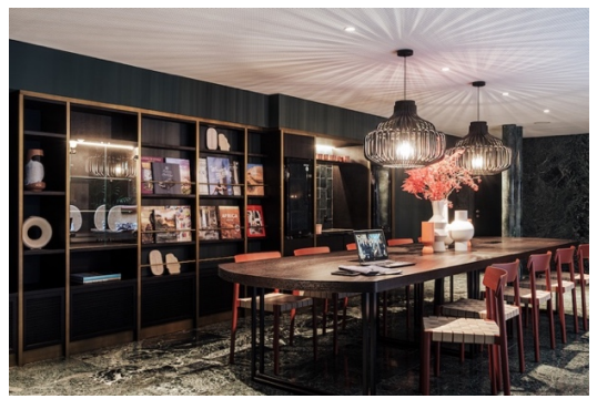
The co-working space at the AMERON hotel for accredited journalists during the ZFF.